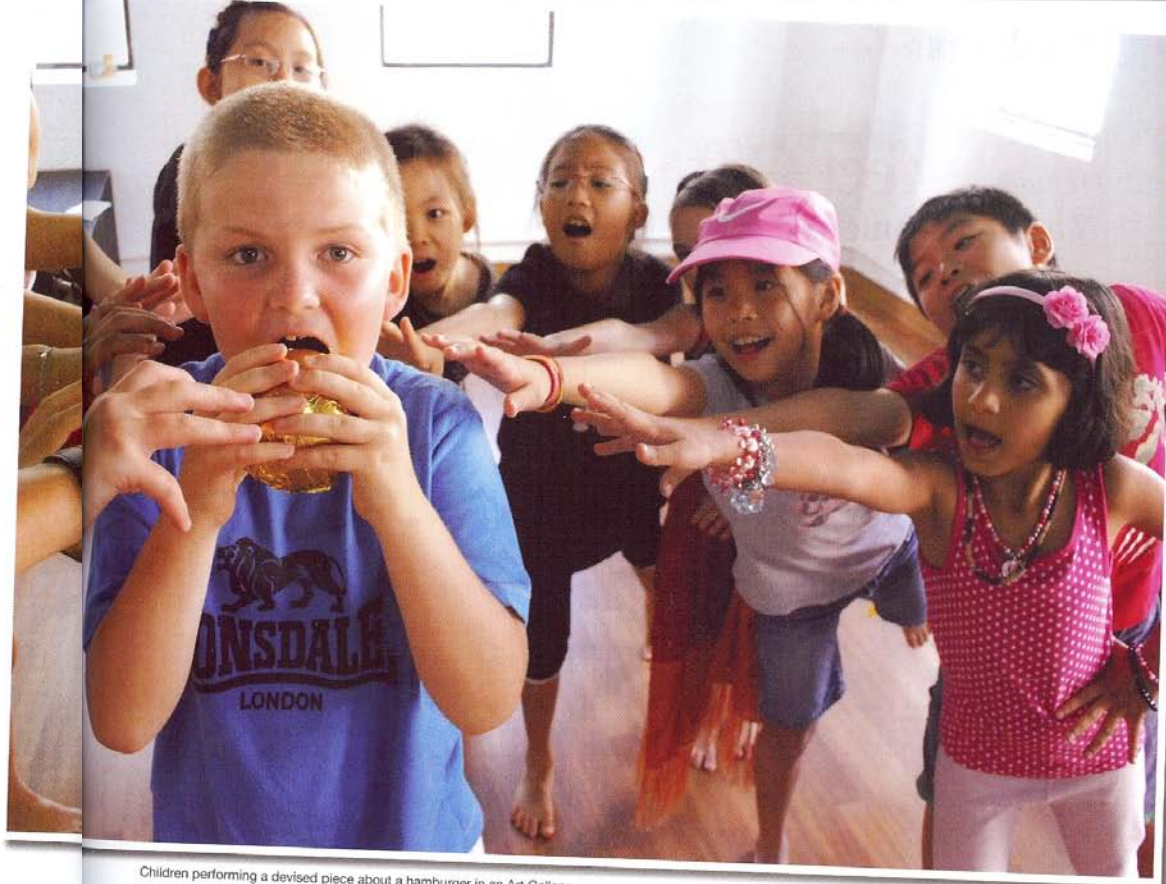
Children performing a devised piece about a hamburger in an Art Gallery.